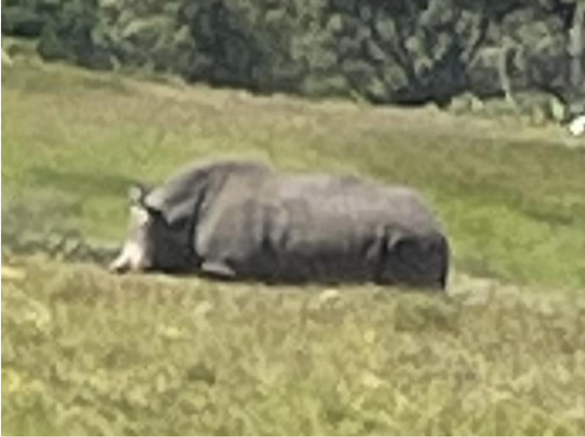
Sorry if the picture quality is not the greatest.